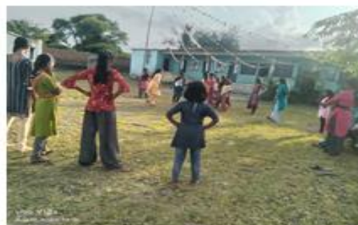
Sports with Zeal....