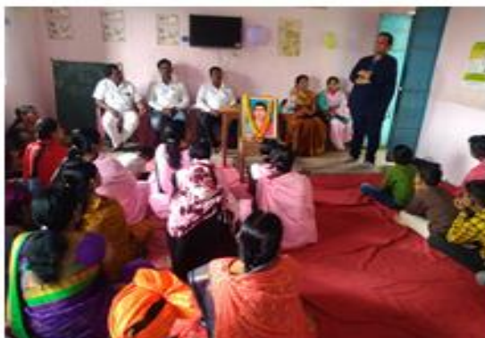
Expert Visit to activity Center