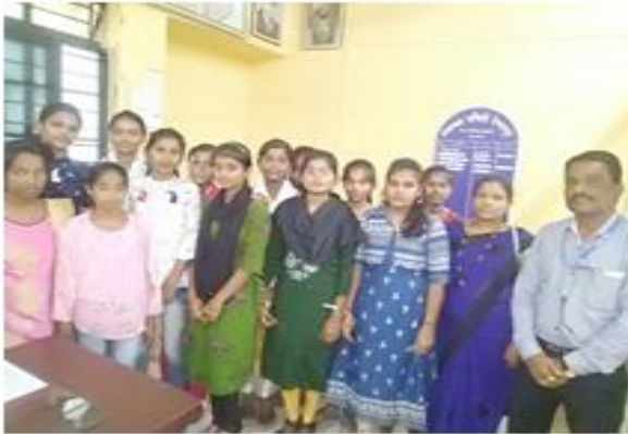
Visit to Panchyat Samiti Renapur