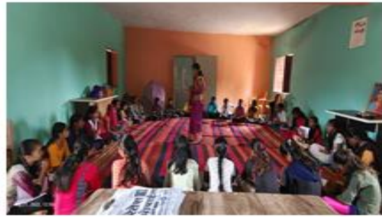
जीवनकौशल्ये प्रशिक्षण सत्र