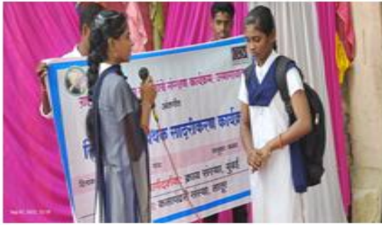
कलापथकात प्रबोधन नाट्य सादरीकरण करताना