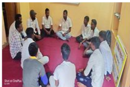
Meeting With Youth Group