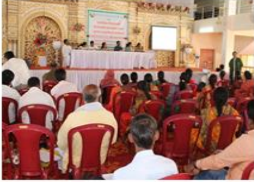
बालविवाह प्रतिबंधात्मक जिल्हास्तरीय कार्यशाळा