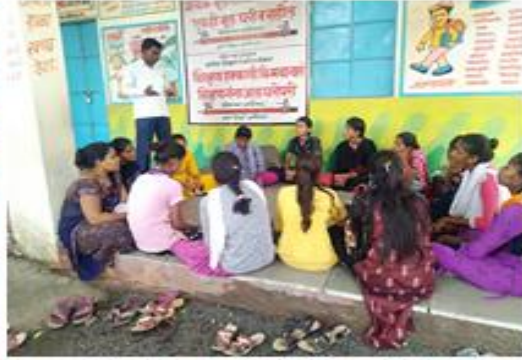
किशोरी विकास कार्यशाळा