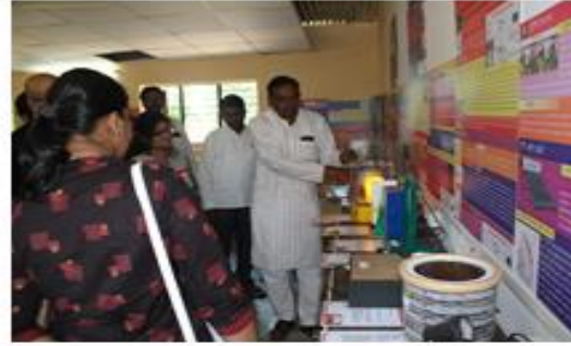
स्टेम प्रयोगशाळा उद्घाटन